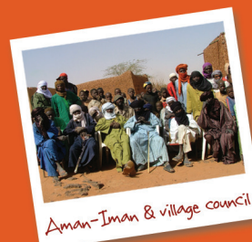
Aman-Iman & village council

A partnership has been set up with the local NGO Tanakra, the NGO that both runs and supervises our projects. Over the course of this partnership Aman-Iman has set up strong relations with the local village chief and village council.