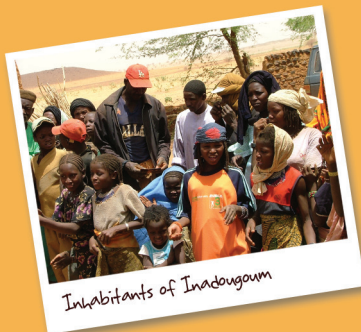
Inhabitants of Inadougoum

North of the city Tahoua, in the middle of the desert lies the village of Inadougoum. The area surrounding the village covers more than 900 km 2 and approximately ten thousand people - Tuareg, Haussa, Fulani and Woudabe - live in thirteen different communities and together these communities have fifty-thousand head of cattle. The thirteen villages in the region are cut off from any form of social service, such as sanitation, health care and education and are not familiar with the concepts of emancipation and sustainable agriculture.